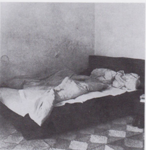
5 Bilder (5 Pictures) Late 1960s/early 1970s Booklet